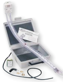
1212 gas pressure kit